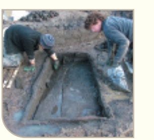
Archaeologists excavating the trough of a fulacht fiadh uncovered at Newrath .