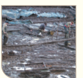
Archaeologists excavating a Bronze Age trackway uncovered at Newrath .

Up to a dozen oval and circular buildings were uncovered in Adamstown on a south-east-facing slope of Knockanagh Hill, overlooking Dooneen Marsh. Most were constructed of wooden posts, often with internal supports, while some had slot-trench foundations. A number of the buildings were used for metalworking, evidenced from internal and external floor surfaces, slag, kilns, and a probable smithing hearth. Evidence of an animal stockade formed by a large curving arc of stake-holes, and further pits and small ditches suggested intensive settlement. A number of larger ditches, probably field boundaries, provided evidence of land use continuing into the medieval period. Finds included sherds of coarse-ware pottery (possibly Bronze Age), a saddle quern, a lignite bracelet fragment, a blue-glass bead and medieval pottery sherds.